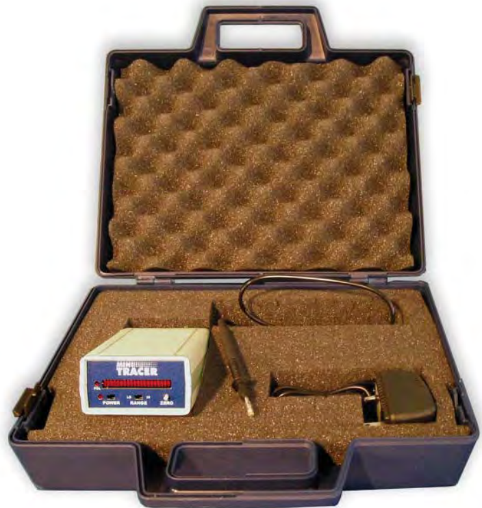
MINITRACER™ PORTABLE SNIFFER