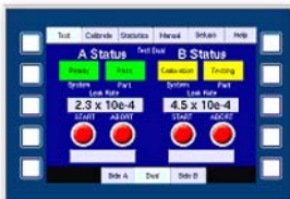
DUAL TEST SCREEN