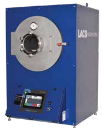
LACO Vacuum Oven with Integrated HVC-2500 Heat & Vacuum Controller

Includes all the features of the VC-2500, plus manual or auto heat control, automated thermal cycles and ramp rates, heat setpoint PID control (up to 2 zones), and multiple temperature reading display.