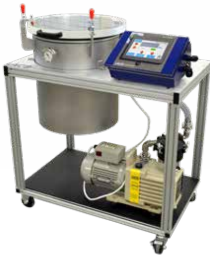
Table-top vacuum system with VC-2500 Vacuum Controller

Whether you need vacuum control, temperature control—or both—LACO's family of controllers provides a comprehensive choice of control solutions for your vacuum system. From manual vacuum control to fully customizable software and test recipes, we thoughtfully designed each controller to support your price range and unique application.