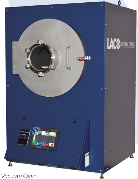
18" Cylindrical Vacuum Oven