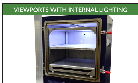
VIEWPORTS WITH INTERNAL LIGHTING