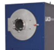
Stainless Steel Door with 6" Viewport