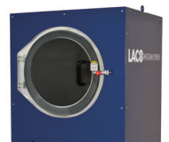
Clear Door with Internal Lighting