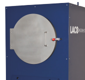
Stainless Steel Door